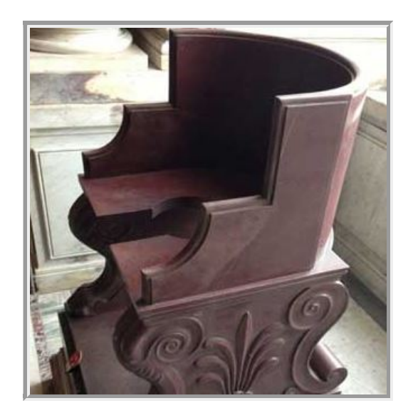
The Papal "Eunich" Estercoraria Chair

A lodge should assemble at least once a month. More than 40-50 are inconvenient; when a lodge comes to be this numerous, some of the ablest should separate and get their own warrant to work. A new lodge cannot be formed unless it has at least 3 master masons, to be nominated as installed officers.